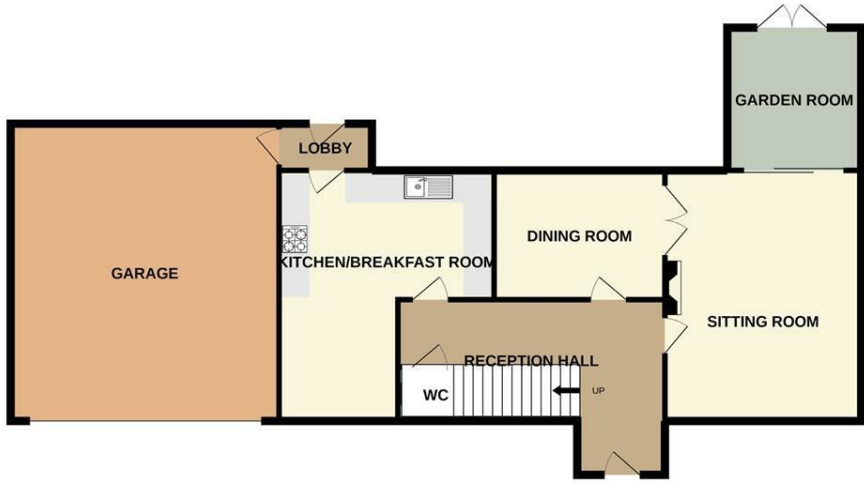
GROUND FLOOR 118.7 sq.m. (1277 sq.ft.) approx.